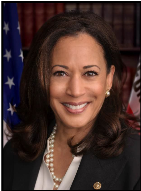
KAMALA D. HARRIS