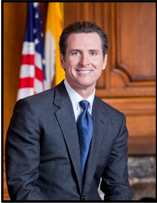
GAVIN NEWSOM Governor of California (D)