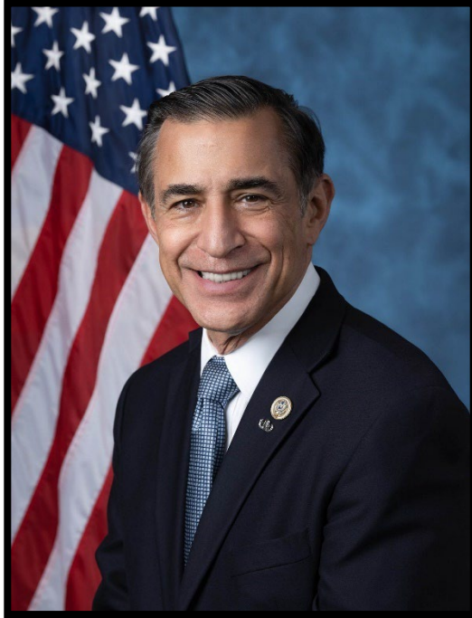
DARRELL ISSA Congress 48 th District (R)