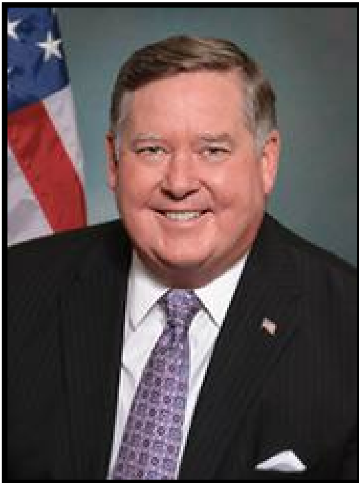
KEN CALVERT Congress 41 st District (R)