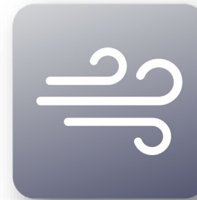
Flood & Blowsand Control