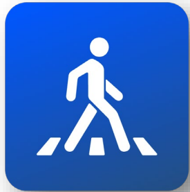
Safe Streets & Roads